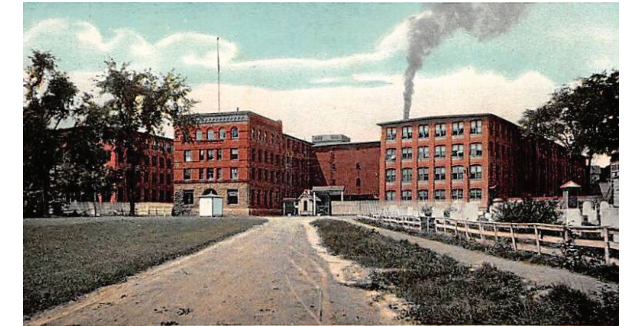
Eagle Lock Works, Terryville, Conn.